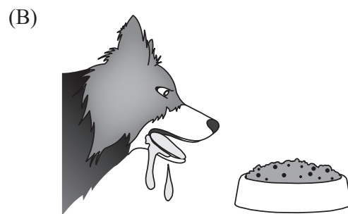
Dog sees food and salivates.