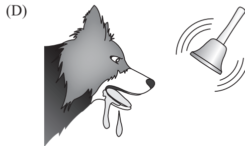
Dog hears bell and salivates.