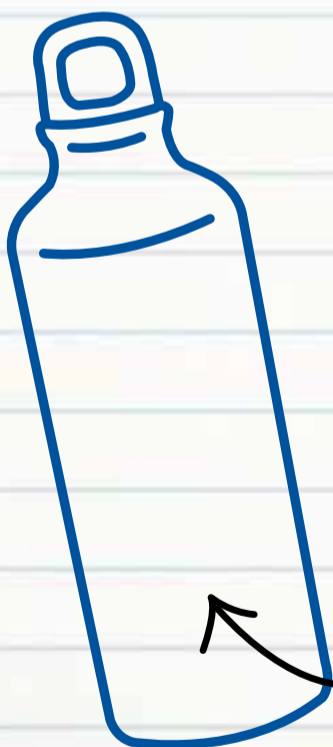
stainless steel water bottle!