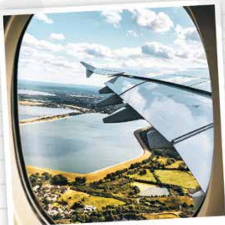
An open mind