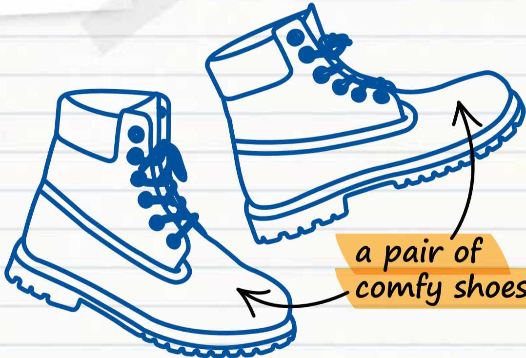
a pair of comfy shoes!