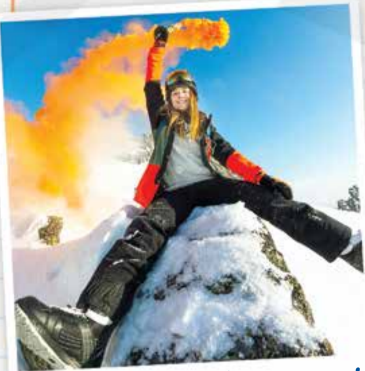
A sense of adventure!