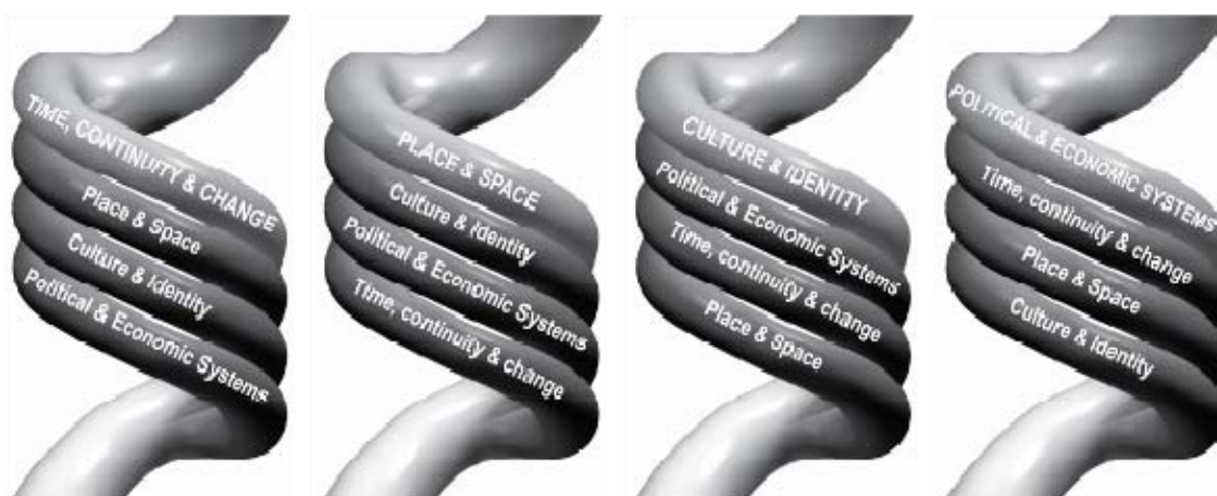
Figure 3: The spiralling approach

There are many approaches that a course in Aboriginal and Torres Strait Islander Studies may incorporate to enable a deeper understanding and connectedness to the subtleties and complexities of the distinct cultures and identities. Each of the approaches outlined below functions as an illustration of how knowledge and knowing is integrated and holistic. The strategies are not exhaustive, but rather they are a set of tools to gain further insight into how the worldviews of Aboriginal and Torres Strait Islander peoples need to be and can be incorporated into the planning, design and delivery of teaching and learning.